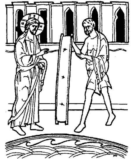
HEALING OF THE PARALYTIC

Our Parish Family wishes special blessings upon all our mothers, grandmothers, god-mothers and spiritual mothers on this Mother's Day. Grant them, O Lord, many happy and blessed years! Многая Лѣта! Христос Воскрес!