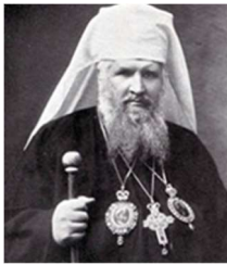
The Servant of God Metropolitan Andrey (*July 22, 1865 - +November 1, 1944)

The Metropolitan lay calmly with eyes shut and breathed with difficulty, as he had previously. Then he began to pray again. He opened his eyes and began to talk to us: